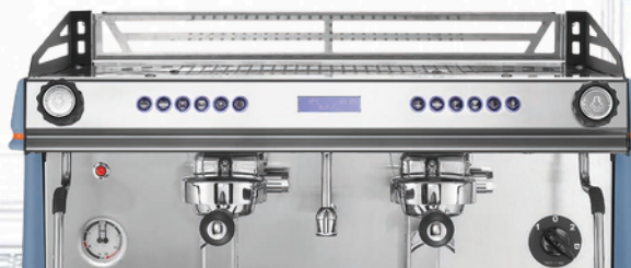
Versione Plus / Plus Model